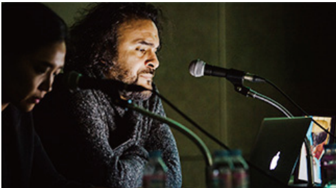
↑ Kader Attia, winner of the "2017 Yanghyun Prize"