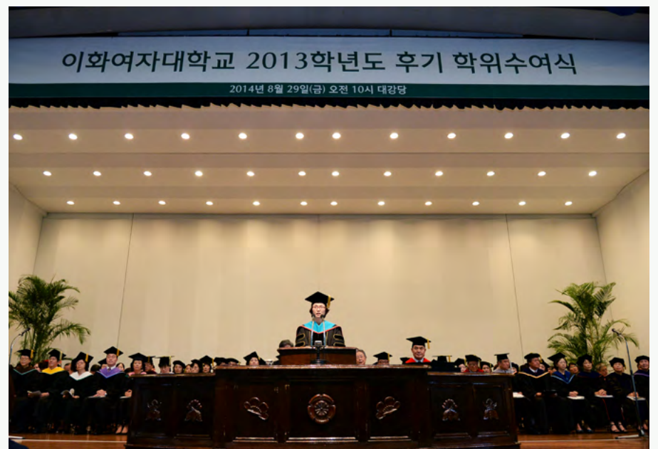
Photo: Welch-Ryang Auditorium

On August 19, Commencement Ceremony took place in Welch-Ryang Auditorium. A sum of 1,841 undergraduates received their degrees on this day. This event was streamed live and shared on Ewha YouTube channel ( http://www.youtube.com/user/ewhauniv ), for students and families who could not attend. Commencement takes twice a year, in spring and winter. So far, Ewha produced 158,802 undergraduates, 40,648 graduates, and 3,196 Ph.D. students. This spring, 2,243 students received their bachelor's degrees.