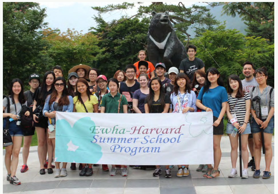
Photo: Field Trip at Seorak Mountain National Park

Co-hosted by Ewha Graduate School of International Studies and Harvard University, the annual Ewha-Harvard Summer School was held from June 23 to August 1. The program has been running since 2006 and was designed to develop global perspective while studying Korean history and culture at Ewha. On average, around 10 Harvard students visit Ewha for this program each year, which is reflective of university's renowned research competence. In 2014, 7 Harvard students and 16 Ewha students attended this program under the theme of "Cinema Korea: Documenting Korean Society through Film".