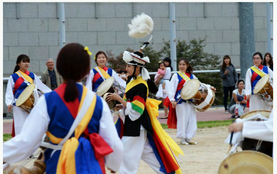
Photo: (left) Bibimbap Mixing Event (right) Korean Traditional Percussion Quartet